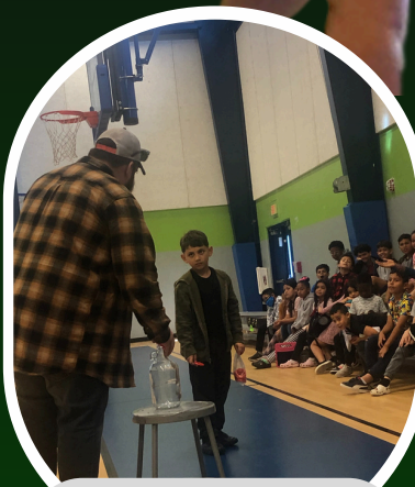
Kindness Through Action