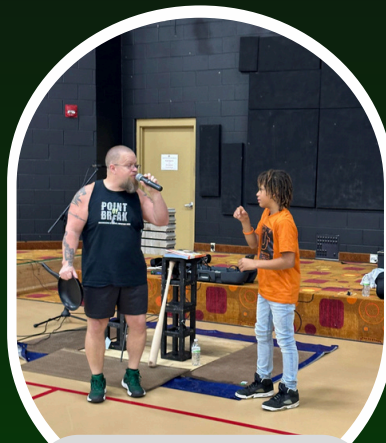
Leadership Through Example